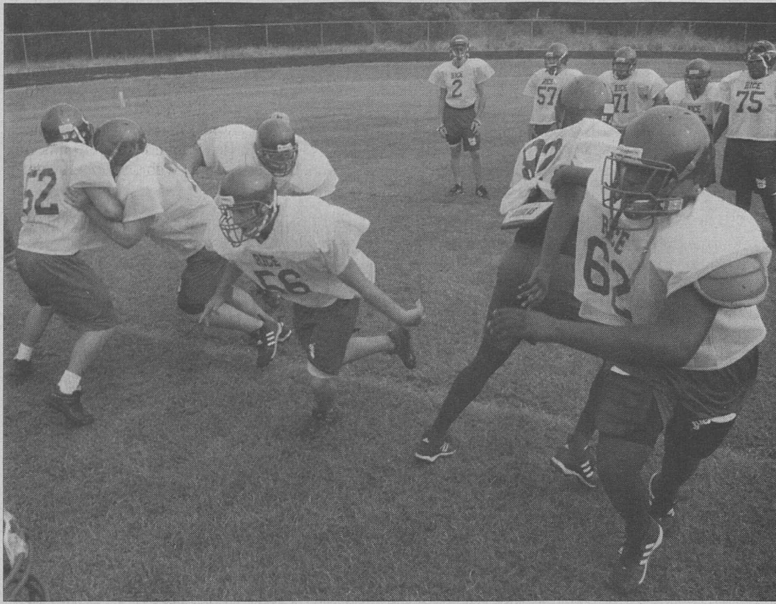
The Rice Raider line works on blocking during the second week of workouts.